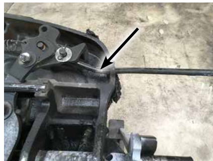
The above bent handle is no longer usable and must be replaced.

Never try to straighten a bent or broken pull handle. Replace with kits shown below.