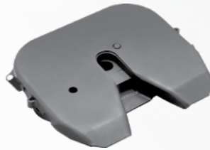
SLTPLCD700-D5 (Driver side release)