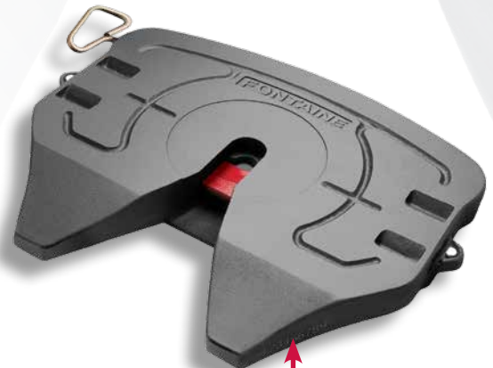
No-Slack® right side view serial number location

Serial number engraved directly into the right side of fifth wheel skirt. Note: position 5 and 6 of the serial number indicates the year built. Serial number is always 9 digits.