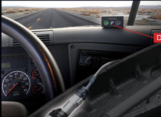
Dashboard Visual Indicator

An additional check to help protect your equipment and cargo