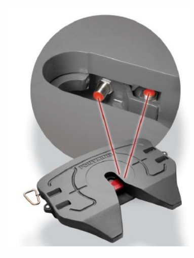
Figure 2: SmartLock fifth wheel