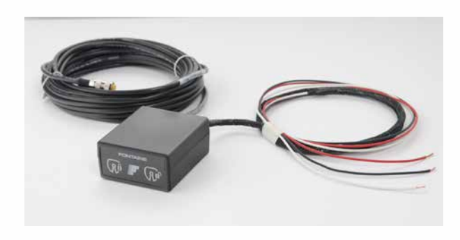
Figure 3: SmartLock display box

Coupling display box with the 31 foot wire (display to fifth wheel connection)