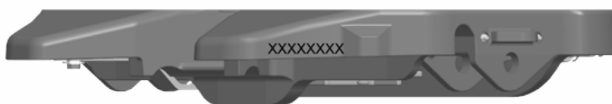
Figure 1: New style (after 11/27/2000) serial number location

Serial number engraved directly into the right side of fifth wheel skirt.